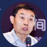
杨元喜 中国科学院院士、北斗导航系统副总设计师、全国政协委员