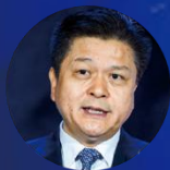
李明德 自然资源部中国地质调查局副局长、联合国全球地理信息管理专家委员会共同主席