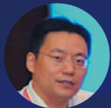
单志广 国家信息中心信息化和产业发展部主任