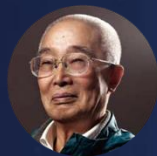
刘先林 中国工程院院士 摄影测量与遥感专家