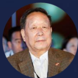
李德仁 中国科学院院士 中国工程院院士