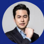
郑宇 京东金融集团副总裁、 首席数据科学家