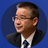
田玉龙 国家国防科技工业局副局长、党组成员