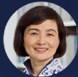
孟立秋 德国自然科学院院士、巴伐利亚科学院院士 慕尼黑工业大学航空摄影测量、制图研究所所长