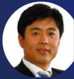
孙玉国 中国地理信息产业协会会长、四维图新创始人