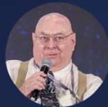
Russell Shields Navteq (现Here地图) 创始人